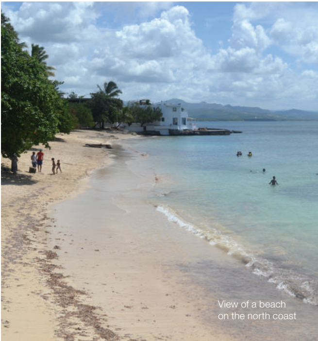
View of a beach on the north coast